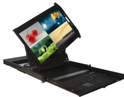
Display rotate to the right