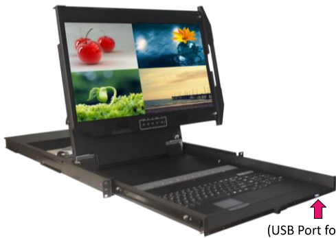
(USB Port for device access)