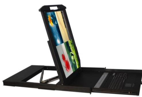
Lift the display